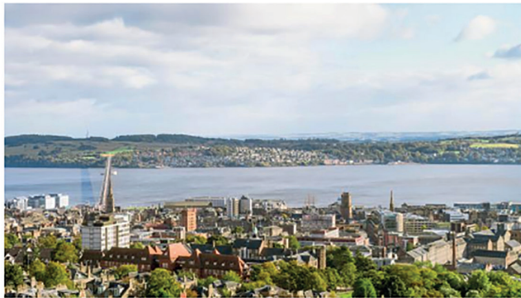
Dundee's Water's Edge development is part of a £1 billion regeneration project